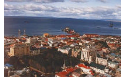
Panoramic view of Punta Arenas and Magellan strait

Magellan strait crossing on Ferry Boat (2 h and 1/2) up to Porvenir, small town (4000 p.) in front of Punta Arenas. The existence of Porvenir is due to gold discovery in the nearby mountains of Sierra Boquerón and most of its inhabitants are of Croatian background. Lunch.