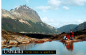
Laguna Esmeralda, one of favorite local trekking destinations

Lodging at Estancia Rolito (*) and Parador Yawen (*) located on the first foothills of the Cordillera. Dinner. (*) The group will divide due to the limitation of available beds.