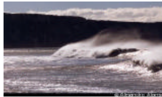
St. Paul Cap (Tierra del Fuego)

the 1950's, led to a regional diversification. Due to its recent tourist development, Ushuaia, the world's southernmost city, is the island most popular destination. However the tourist presence is so limited that Nature continues to reign as the only and indisputable sovereign. Discovering it by yourself is your duty.