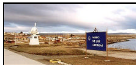
Americas Avenue, Porvenir

Free Morning for a town visit. Lunch. Afternoon, excursion to Salesian Mission with visit of the local museum of the mission. Merienda (country meal). Possibility of horse riding (optional). Return to hotel. Diner.